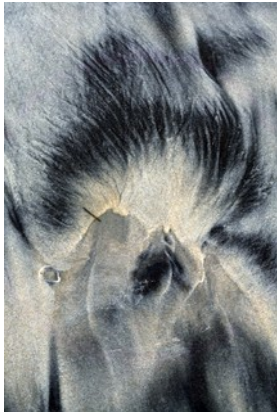
Traces on the sand left by the surf

All colors exist in the native state, but photographic techniques allow to reveal and sublimate them.