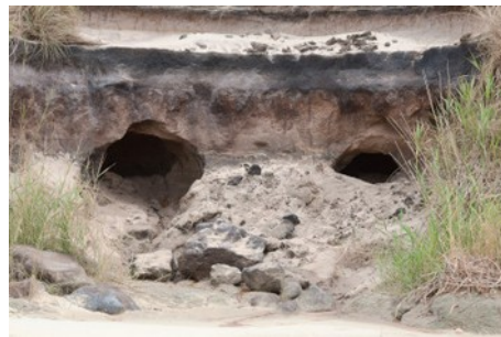
Caves appeared in 2018 at the level of the dogs beach at euronat.